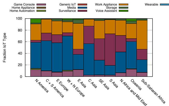
Figure 3: IoT Device Distribution by Region —IoT device type distributions vary between different geographic regions. For example, Surveillance devices are most prevalent in Asia, whereas Home Automation devices only appear in North America and Europe.

have unique preferences for device types points to deeper differences between regions, making it harder to reason about IoT in aggregate and more challenging to generalize findings from one region to others.