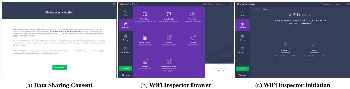
Figure 1: WiFi Inspector —WiFi Inspector allows users to scan their local network for insecure IoT devices. Data sharing back to Avast for research purposes is an explicit part of the installation process, and presented to the user in plain English. For ease of reading, we duplicate the text shown in panel (a) in Appendix A.

future, but rather one of today. We argue that there already exists a complex ecosystem of Internet-connected embedded devices in homes worldwide, but that these devices are different than the ones considered by most recent work. We hope that by shedding light on the devices consumers are purchasing, we enable the security community to develop solutions that are applicable to today’s homes.